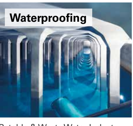
Potable & Waste Water Industry, Balconies, Terraces, Basements & Foundations

Seamless Resin Flooring, Subfloor Preparation, Car Parking Structures