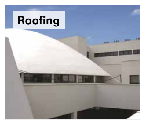
Liquid Applied Systems, Felt Systems, Vegetated Roofing