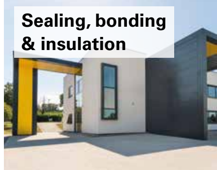
Window Insulation, Façade Construction, Exterior Insulation & EIFS, Structural & Inplant Glazing, Insulated Concrete Forms (ICFs)

The product brands housed within Tremco CPG Europe cover a wide array of different construction needs and provide a wealth of complex services, support and systems that are rarely found together under one roof.